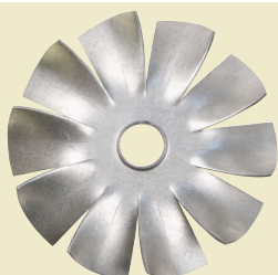
10 - Wing: B Style

Beckett Air's axial fans are found in all types of food preparation equipment, such as convection ovens and in electronics or motor cooling applications. Axial fans listed are manufactured at Beckett Air (Ohio) and are available in a wide range of diameters from 2.0 to 4.0 inch (50.8 and 101.6 mm).