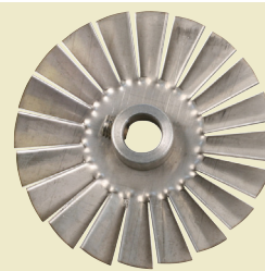
20 - Wing: W Style