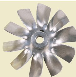
10 - Wing: S Style